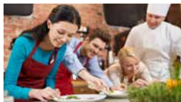
Masak Masak Local Cuisine Cooking Course