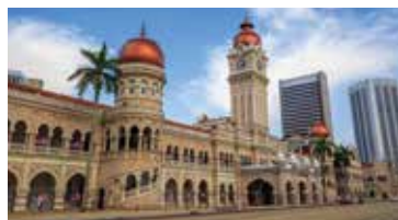
Old City Walking Tour

The following programmes will be provided free of charge for Accompanying Persons. Specific timings will be provided closer to the Conference dates and in some cases are limited in numbers.