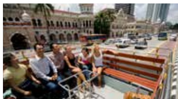
KL City Open Air Bus Tour