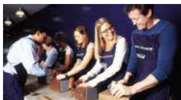
Royal Selangor Pewter Factory Tour