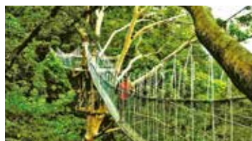
FRIM Canopy Walk