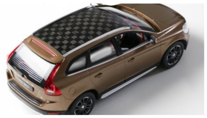
Lignin based carbon fibre demonstrator.

A toy car demonstrator was produced in a project financed by the Bioinnovation a strategic research program by VINNOVA, Formas and the Swedish energy agency. The demonstrator project was coordinated by Innventia and was a cooperative project involving Blatraden, KTH and Swerea SICOMP cofounded by industrial partners of the Innventia research programme. The existing roof of the toy car was replaced with a roof consisting of a carbon fibre composite where the carbon fibres were made of 100% softwood kraft lignin. The toy car was also equipped with a lithium ion battery having a negative electrode containing lignin based carbon fibres. The toy car is a big step towards the vision of the manufacture of light weight forest based material in the future of bioeconomy.